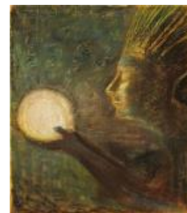
M. K. Čiurlionis, Friendship

Psychoanalysis, Trauma and Severe Mental Disorders